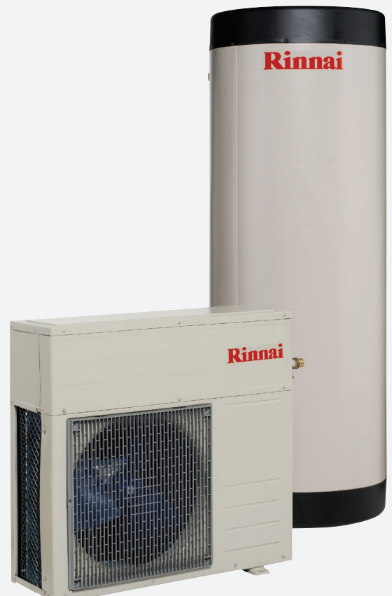
Split Heat Pump