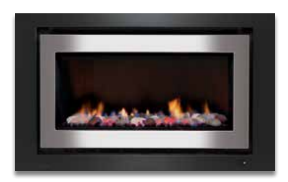
Stainless Steel on Black with Pebbles