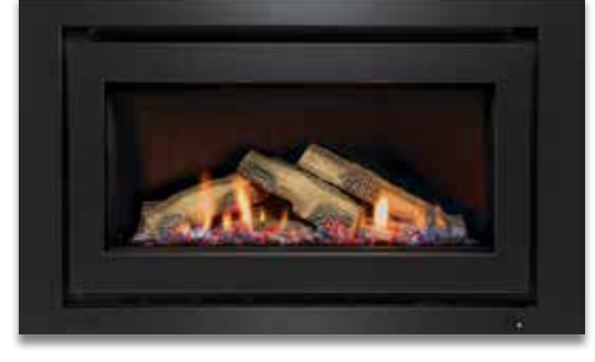
Black on Black with Australian Eucalyptus Logs